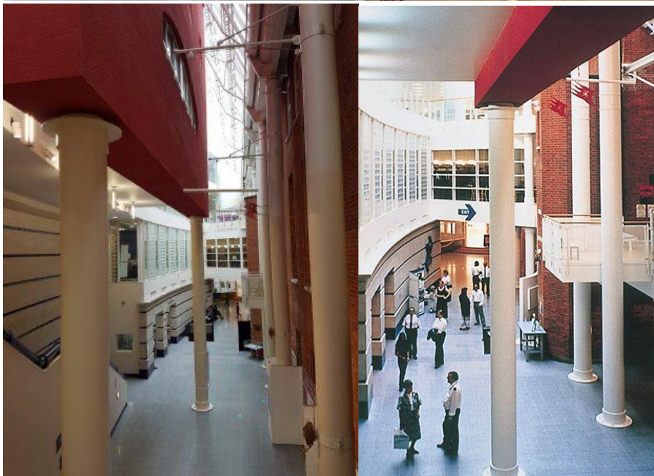
Croydon Clocktower, Atrium